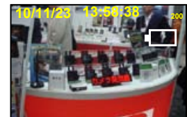
Portable DVR Operation